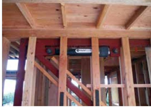
Typical damper installation.

Dampers in residential construction are somewhat rare, and this project was a first for the design team and contractors. Some of the lessons learned along the way, implemented by the design team since, include: